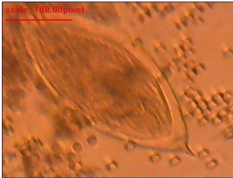
PLATE I: Egg of Schistosoma haematobium viewed under \times 40 objective